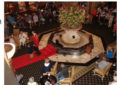
The fountain at The Peabody in Memphis

SAIR website for past papers, you will also notice that the location and date for future conferences is available on the conference tab as well. The SAIR 2014 conference will be held Destin, FL at the Hilton Sandestin Beach Golf Resort and Spa on October 4th—7th. Mark your calendars!