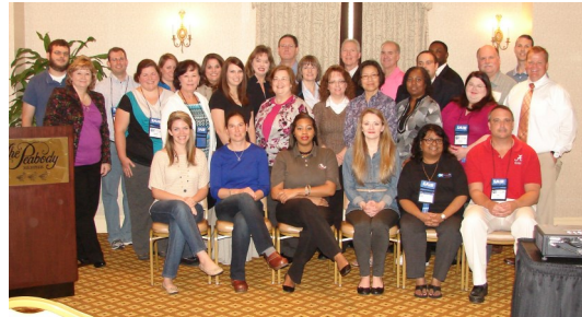
ALAIR Members at SAIR SIG, Oct. 2013

SAIR website for past papers, you will also notice that the location and date for future conferences is available on the conference tab as well. The SAIR 2014 conference will be held Destin, FL at the Hilton Sandestin Beach Golf Resort and Spa on October 4th—7th. Mark your calendars!