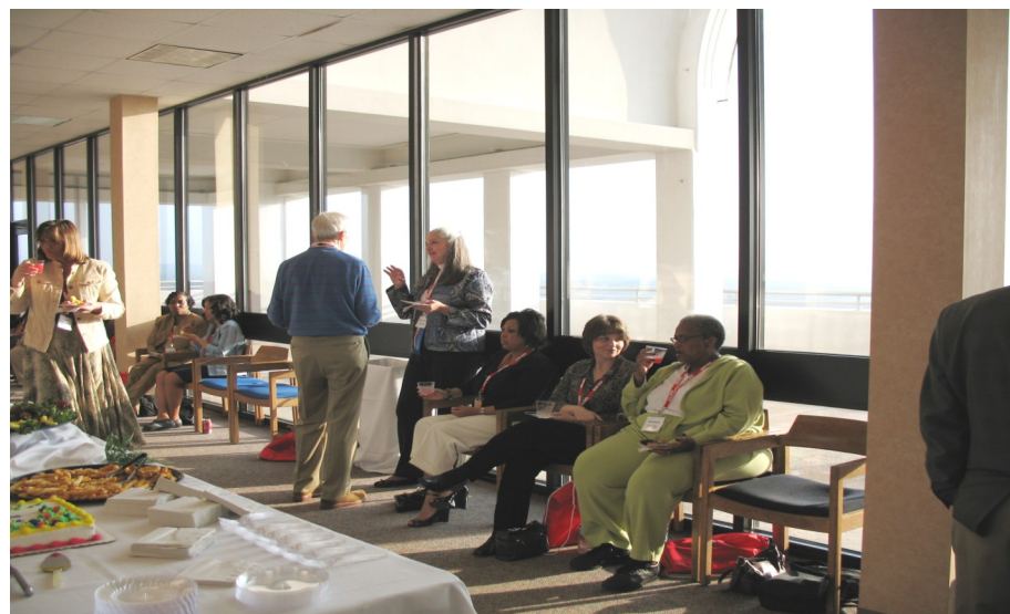
Picture Taken during the 2008 Conference hosted by Jacksonville State University.