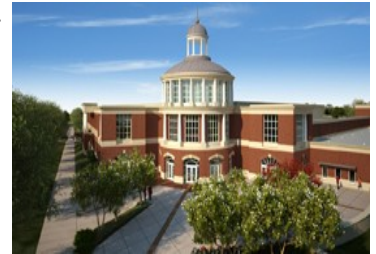
Trojan Arena - Troy University