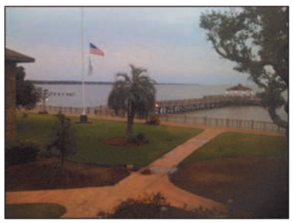
Mobile Bay at the Grand Hotel in Point Clear, AL as Ida approached

After tornado warnings during our last two ALAIR conferences in Jacksonville and Opelika, it happened again. This time it was Hurricane Ida bearing down on the Gulf Coast on the very day of ALAIR's IPEDS Workshop at the Grand Hotel in Point Clear, Alabama. Thirty-two ALAIR members braved the storm to attend the