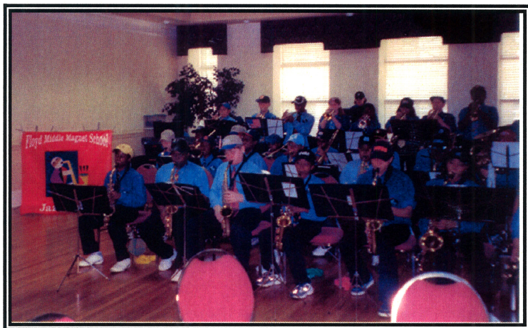
Special Entertainment provided by the Floyd Middle Magnet School Jazz Band