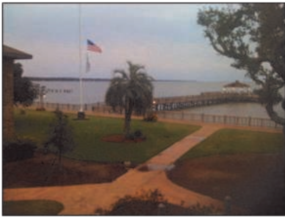
Mobile Bay at the Grand Hotel in Point Clear, AL as Ida approached